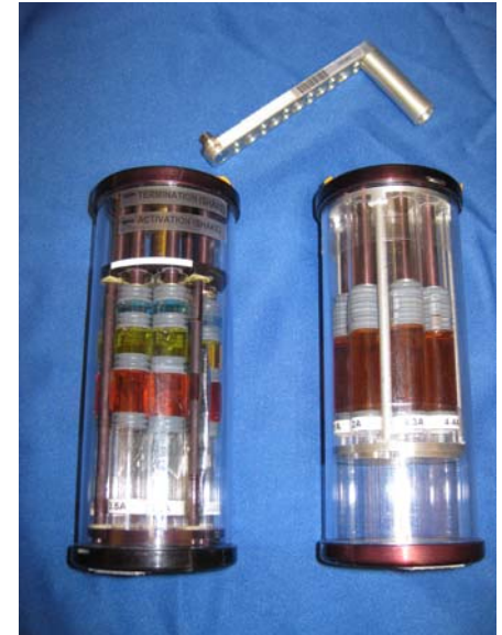
Eight FPAs housed within the Group Activation Pack (GAP-A300)