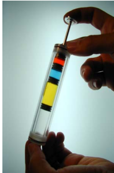
Fluids Processing Apparatus “Microgravity Test Tube”